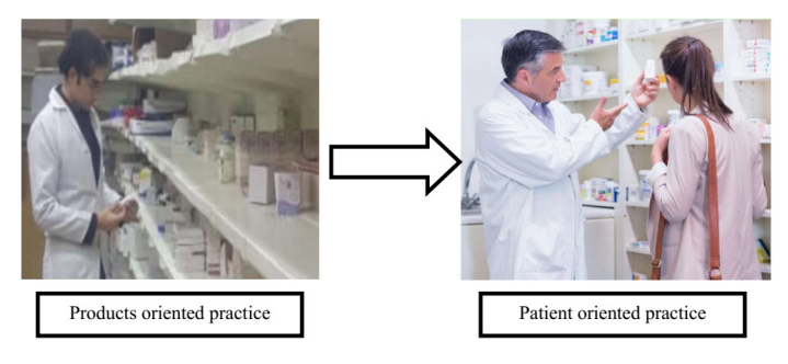
Figure 1: Paradigm shift in world of Pharmacy practice.